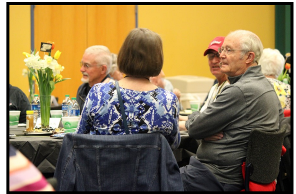
PURA 2023 Spring Conference photos courtesy of PURA members Jim McCammack and Connie